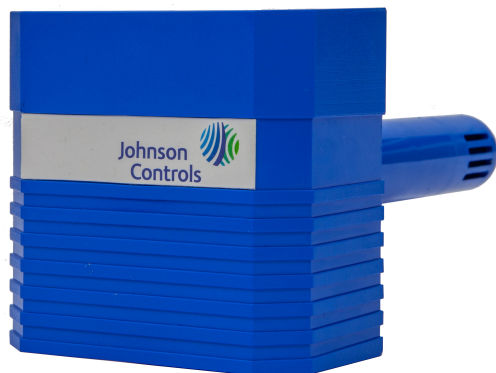
Figure 1: HE-69xx Series Duct Probe Humidity and Temperature Sensor